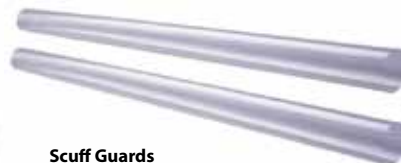
Scuff Guards Patented clear tube shield slides over light's tube to help maintain light clarity by protecting light's tube from abrasion and discoloration