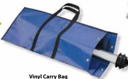
Vinyl Carry Bag Protects and transports light