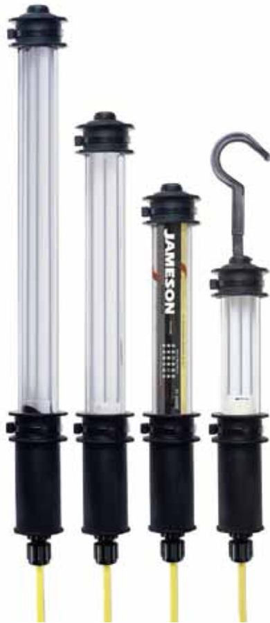
50 Watt 31" 36 Watt 25" 24 Watt 21" 13 Watt 15"