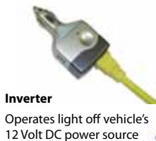
Inverter Operates light off vehicle's 12 Volt DC power source