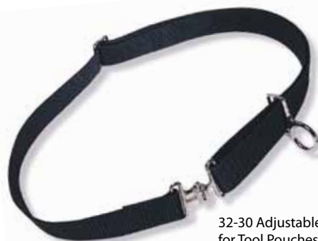
32-30 Adjustable Belt for Tool Pouches