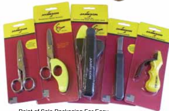
Point of Sale Packaging For Easy Display and Product Visibility