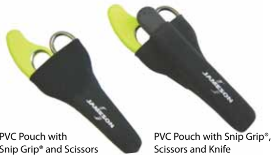
PVC Pouch with Snip Grip® and Scissors