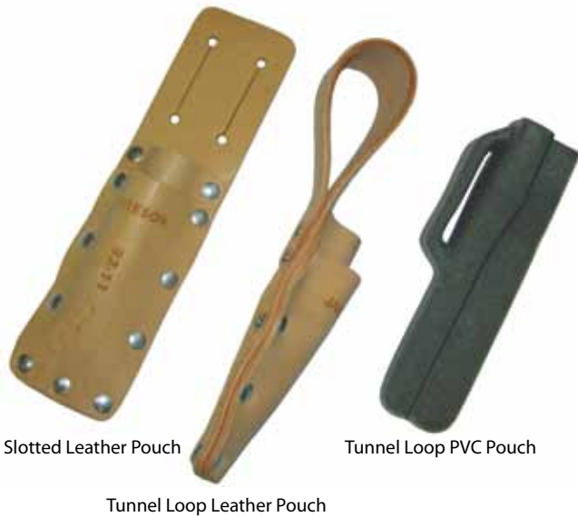
Slotted Leather Pouch

Jameson's black PVC pouches will not split or tear with age and remain flexible, even in cold weather. The PVC pouches carry a lifetime warranty.