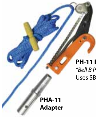
PH-11 Pruner with 1" Center Cut "Bell B Pruner" Uses SB-1T or SB-2 Saw Blade