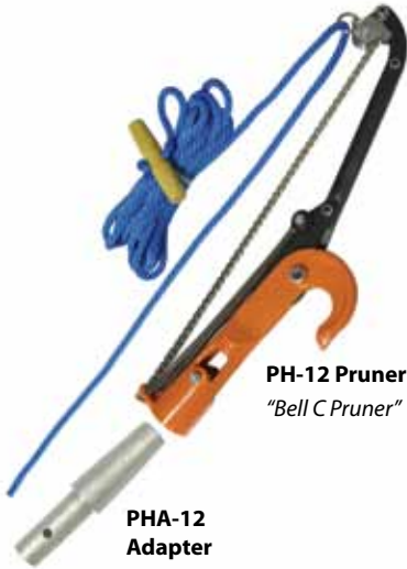
PH-12 Pruner with 1.5" Center Cut "Bell C Pruner"