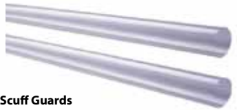
Scuff Guards Patented clear tube shield slides over light's tube to help maintain light clarity by protecting light's tube from abrasion and discoloration