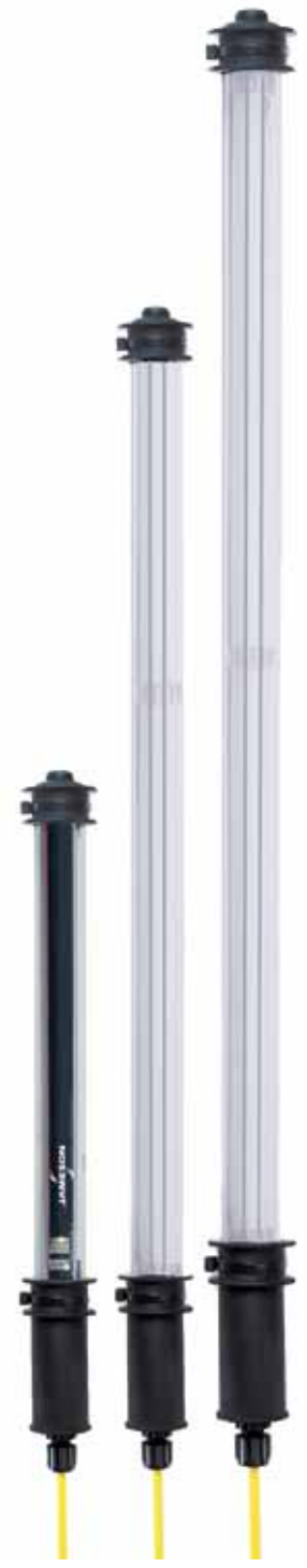
15 Watt 26" 30 Watt 44" 40 Watt 56"

12 Volt Lights feature coiled cord with alligator clips to operate off vehicle's battery.