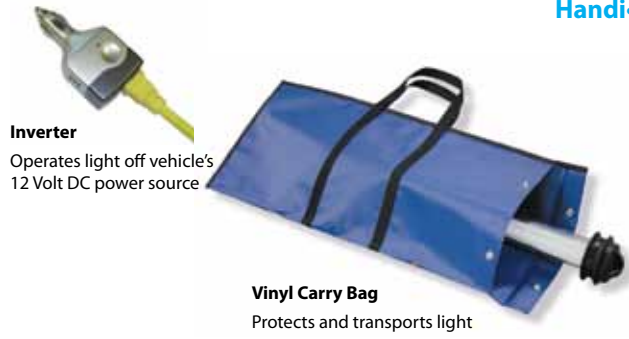
Inverter Operates light off vehicle's 12 Volt DC power source