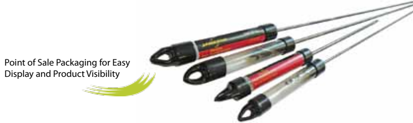
Point of Sale Packaging for Easy Display and Product Visibility