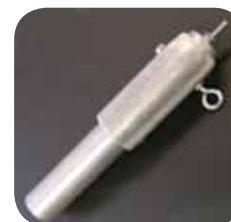
Removable Inductive Head Clamp Adapter Connects to Jameson Extension Pole

Standard 1/4-20 male thread accommodates most manufacturers' induction head clamps.