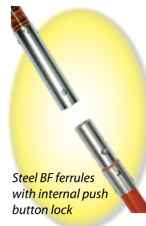
Steel BF ferrules with internal push button lock